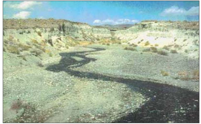
Wilson Creek's "grand canyon".

from Mill Creek for irrigation caused the Mill Creek bottomlands to dry up frequently. By 1929, when the first aerial photos of Mono Lake were taken, natural Mill Creek was already greatly diminished. A once expansive bottomland forest could now be counted only in linear feet along the stream rather than in acres, as evidenced by the many dead trees visible where the forest had once flourished.