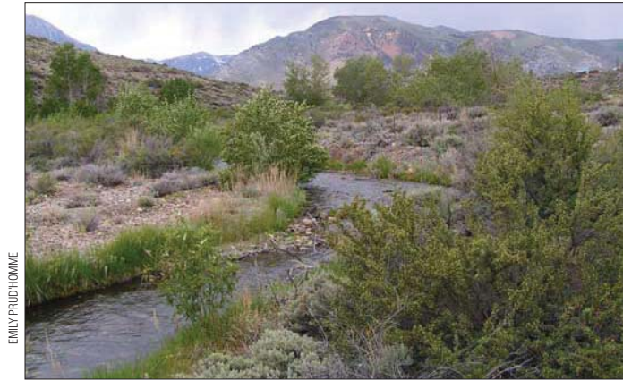
Looking upstream at Mill Creek.